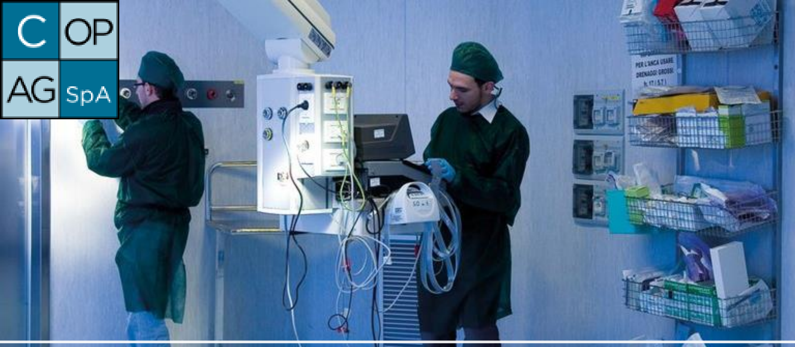
COPAG SpA – Consorzio dell'Ospedalità Privata per gli Acquisti e le Gestioni Global Service in the healthcare sector